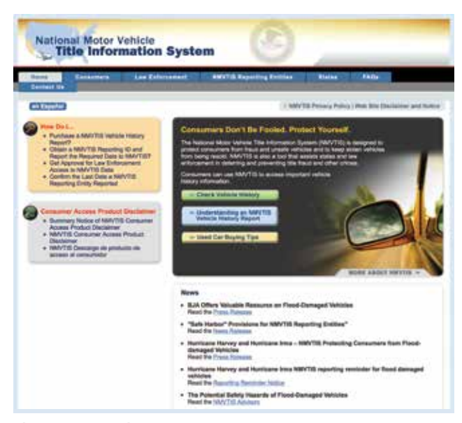
The NMVTIS website

MVTIS is working and being used to stop illegal activities. More and more states, law enforcement, businesses, and other groups are finding the value in checking vehicles against NMVTIS.